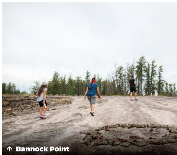
↑ Bannock Point

Breathe in the outdoors in Whiteshell Provincial Park. This slice of the Canadian Shield is rich in sunsets, Indigenous roots, boreal forest and year-round adventure. This summer, hit the road and remember home is where the heart is .