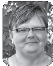
PRODUCTION Nicole Kapusta