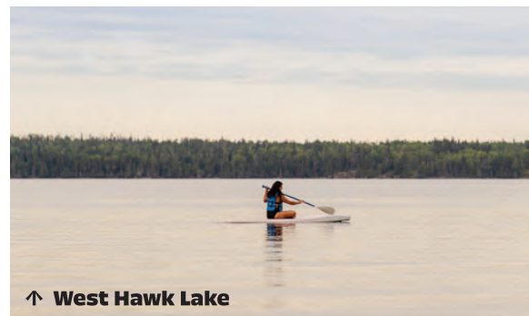
↑ West Hawk Lake

For even more ways to get out into the water, West Hawk Marina rents out paddleboats, kayaks, standup paddleboards and canoes. The marina also provides lifejackets, which are absolutely essential for staying safe while on the water.