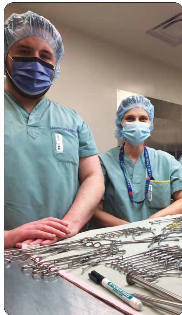
RECORD PHOTOS SUBMITTED