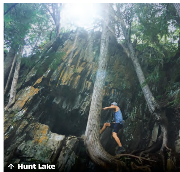
↑ Hunt Lake