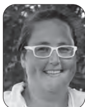
DISTRIBUTION Christy Brown