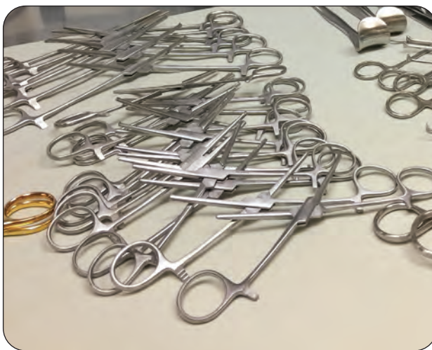
MDR medical instruments.

The MDR department is located on the second floor of the Selkirk Regional Health Centre in Room