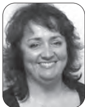
PRODUCTION Debbie Strauss