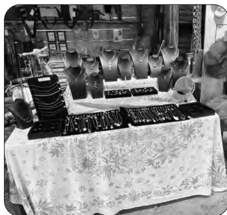
Hand-carved sterling silver and genuine gemstone jewelry.

Over the years, she has developed good relationships with small family run textile companies in Nepal, Thailand, Indonesia, India, and Nicaragua that she collaborates with over the winter on colours, styles, and patterns. Everything is made for her to order, and she even designs some of