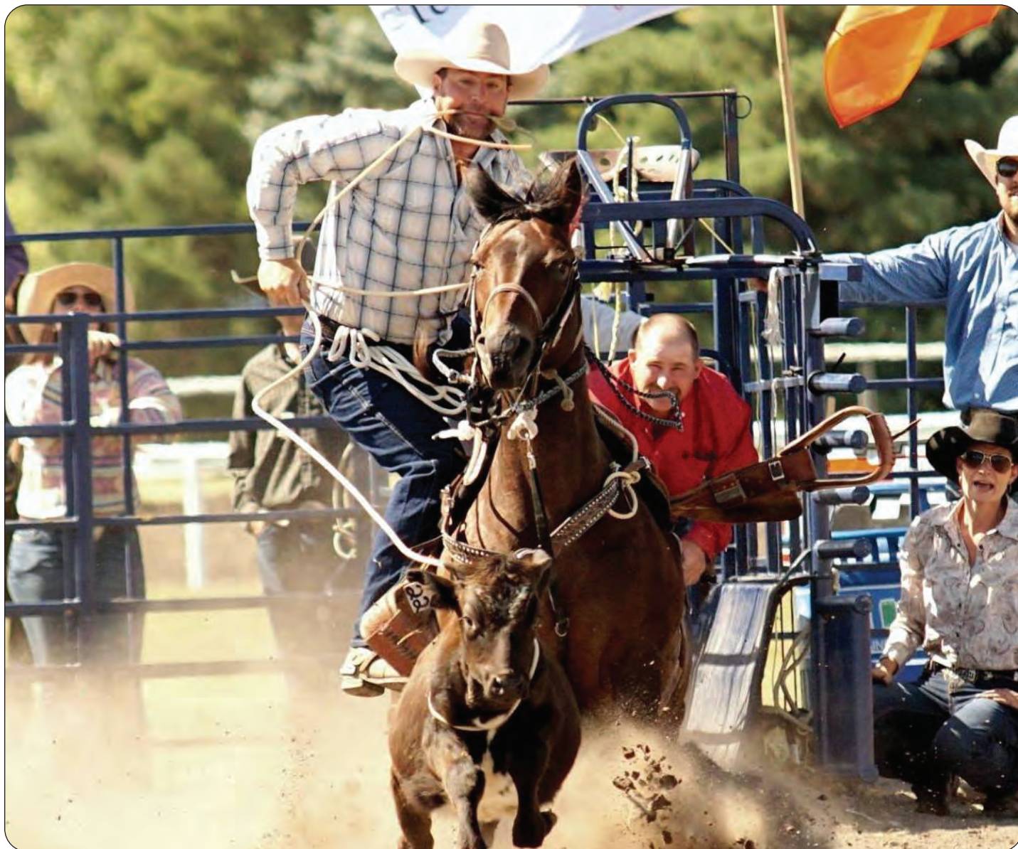
RECORD PHOTO SUBMITTED

"I started roping and attending some smaller jackpots in high school. From